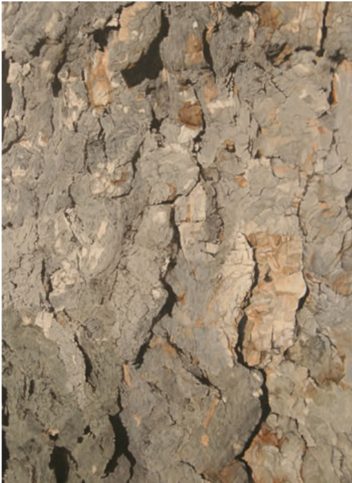
TREE, Wave Hill, NY (c) , 2009 Acrylic on panel 24" x 18" Courtesy of the artist and LA Contemporary, Los Angeles, CA