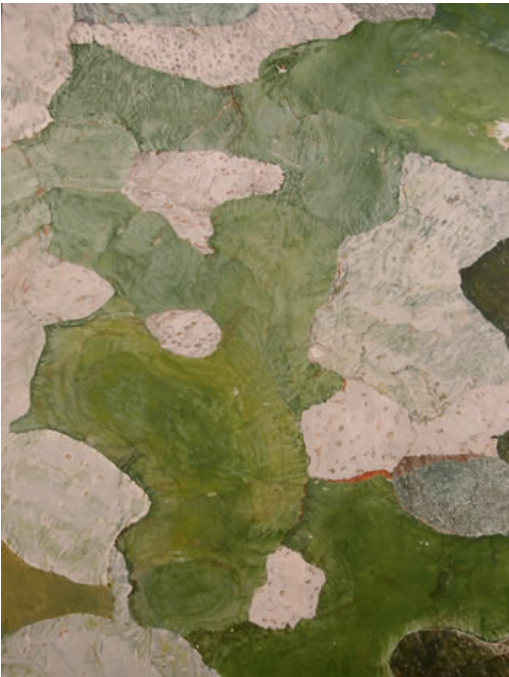
TREE, Wave Hill, NY (b) , 2009 Acrylic on panel 24" x 18" Courtesy of the artist and LA Contemporary, Los Angeles, CA

Acrylic on panel 24" x 12" Courtesy of the artist and LA Contemporary, Los Angeles, CA