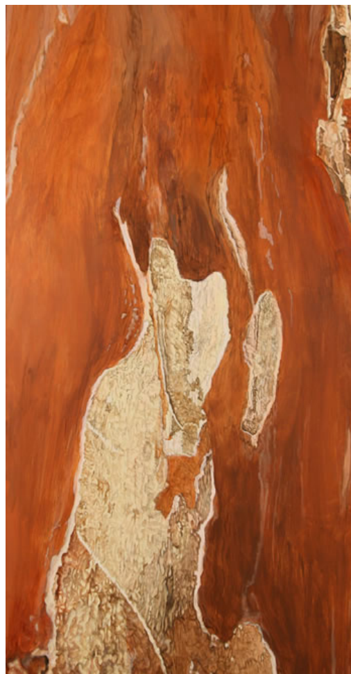
TREE, Wave Hill, NY (a), 2008

More information can be found at: http://www.deanjensengallery.com/backes.htm